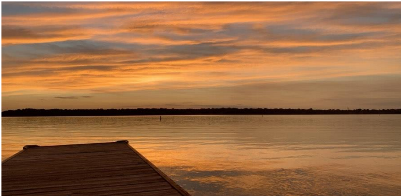
Featured Calendar Photo for February Email your photos, new or old, all year long for our 2022 calendar to: unitedcu@gbta.net